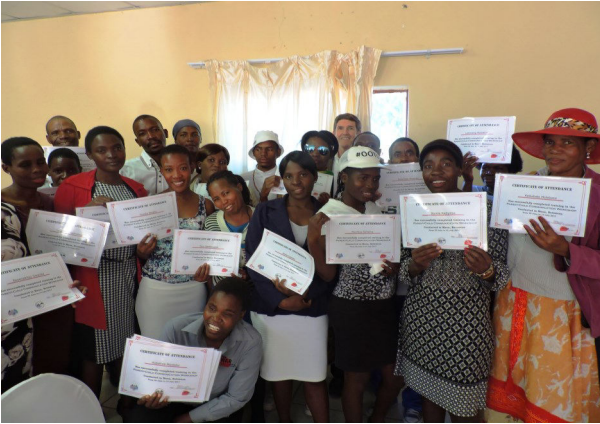
Proud Graduates Showing off their certificates