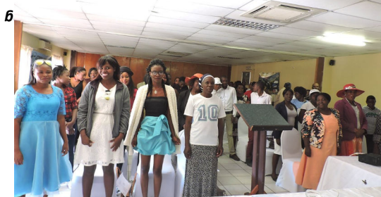
WAR Graduation Ceremony