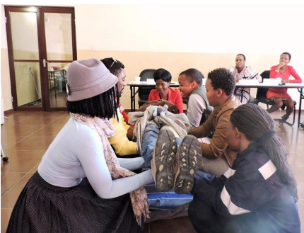
First Aid Training