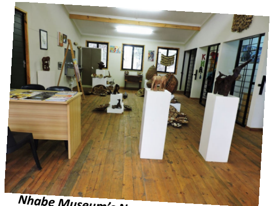
Nhabe Museum's New Artists' Studios