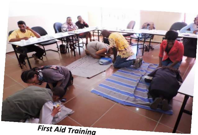
First Aid Training