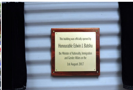
Nhabe Museum's New Buildings Officially Opened