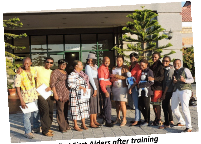
Qualified First Aiders after training