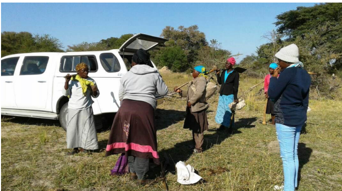
Weavers getting geared up to harvest in the bush

Last month the Travel for Impact Team visited the Craft Centres at Gumare and Etsha. The purpose of the visit was to check on orders for baskets that the weavers are busy with and hear from them the challenges they face and work together to identify solutions. Manjodi and Mos, who are lead members of Etsha 2 and Ngwao Boswa Craft Centre at Gumare respectively, both pointed out that their main challenge was a lack of raw materials as the weavers have to travel far to harvest the natural dyes and palm tree leaves. In response to this, the following week we organised a harvesting trip for the weavers to support them to continue producing the beautiful Botswana baskets the Ngamiland region is famous for.