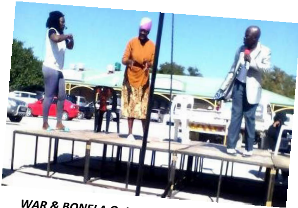
WAR & BONELA Outreach at Old Mall, Maun