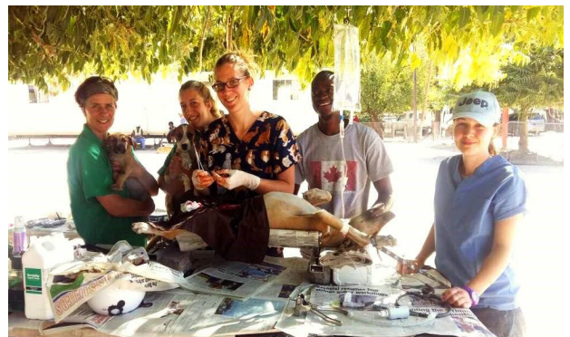
MAWS Volunteer Vets & Nurses with MAWS staff

Last month MAWS went to the villages along the Western part of the Okavango Delta for an outreach. This is their experience as told by the MAWS Volunteers: We left on Saturday morning with one vet and three nurses to do outreach work in Shakawe and Tsau. All surgeries were very successful. We managed to sterilise 40-50 dogs in Shakawe. On the way back we stayed for a couple of days in Tsau which was also very successful. We sterilized close to 20 dogs and came back with a carload full of puppies who will be rehomed to loving new families. The outreach experience is what volunteering is all about. Everyone is so thankful for MAWS going there to help out with the dogs, which makes it a very rewarding experience!