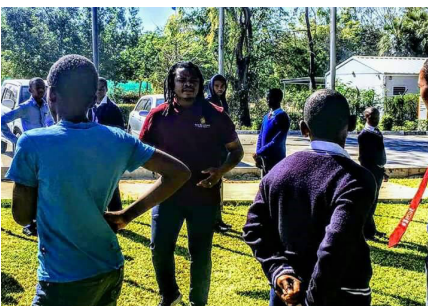
Boys' Leadership Training