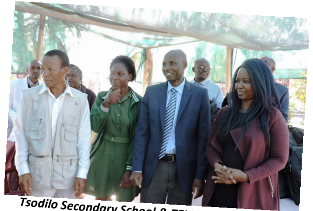
Tsodilo Secondary School & TFI Motivating Students