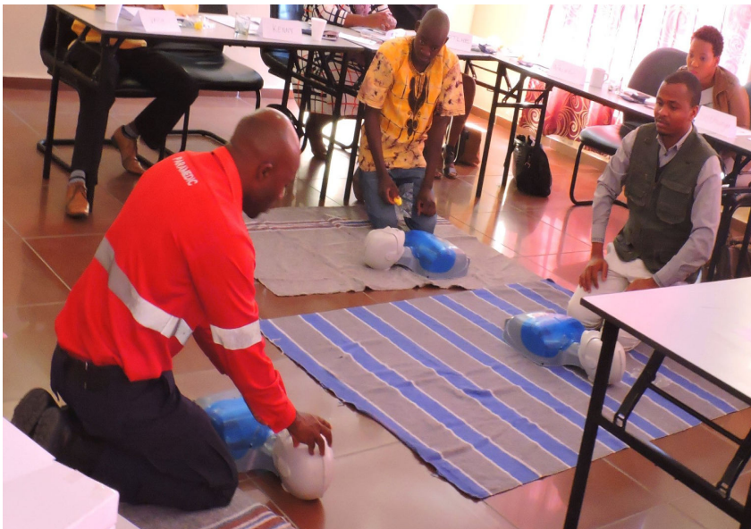
First Aid Instructor demonstrating mouth to mouth resuscitation