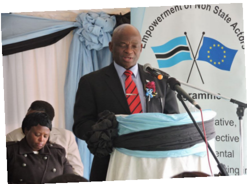
Nhabe Museum Official Opening By the Minister of Nationality, Immigration & Gender Affairs , Hon. Edwin Batsho