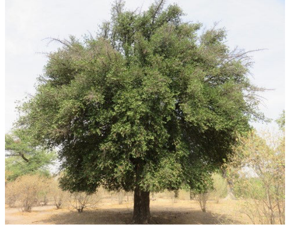
Distinctive shape of the Motsaudi Tree

Brought to you in partnership with The Peter Smith University of Botswana Herbarium in Maun, Desert & Delta Safaris and Sustainable Land Management Programme