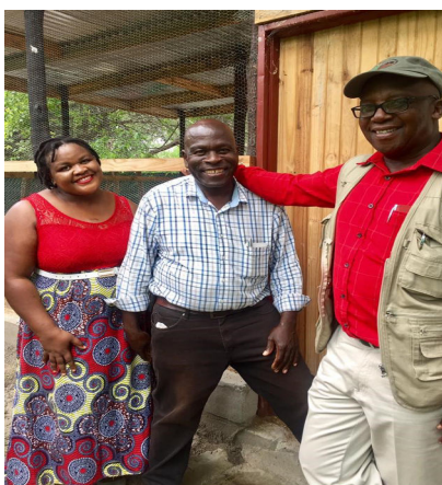
BBL Ministerial Visit