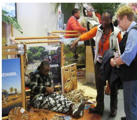
Basket Weavers at ITB Berlin