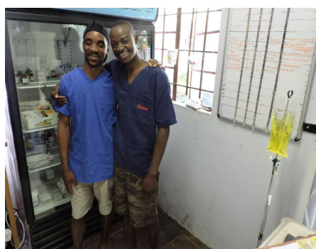
Behind the Scenes at MAWS